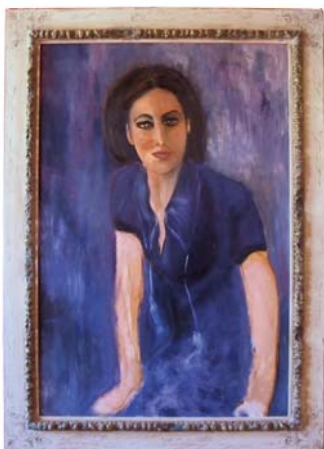
«Mona in blue» Amsterdam 2006 - Oil on canvas (120x80cm)