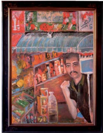
«Our Iranian grocery store» Dubai 2012 - Oil on canvas (116x89cm)