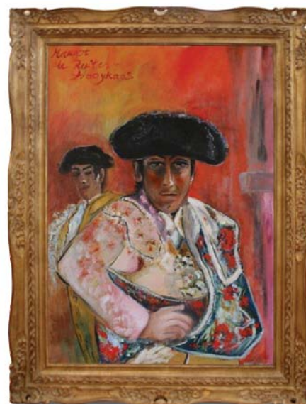
«The Matador» Dubai 2011 - Oil on canvas (100x70cm)