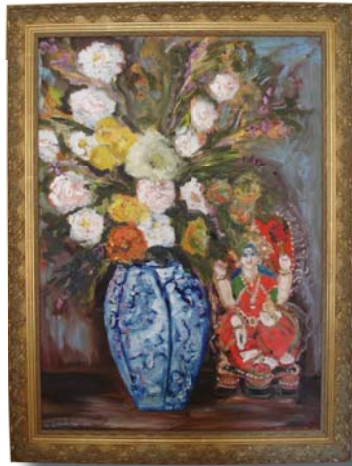
«Indian God and flowers in Dutch Delftware» Monaco 2006 - Oil on canvas (100x70cm)