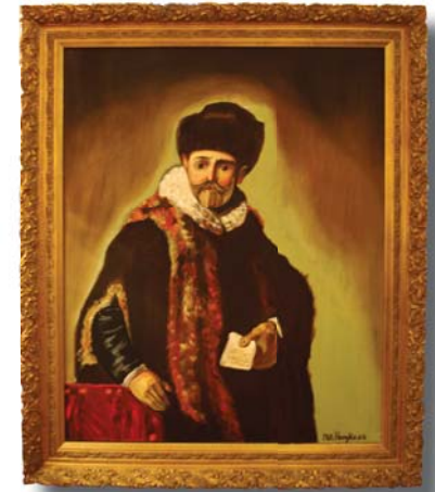
«Russian Man - Monaco 2003» Oil on canvas (120x100cm)