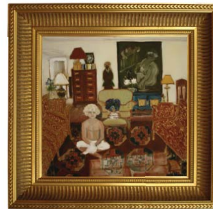
«Baruch as a Buddha» Monaco 2004 - Oil on canvas (60x60cm)