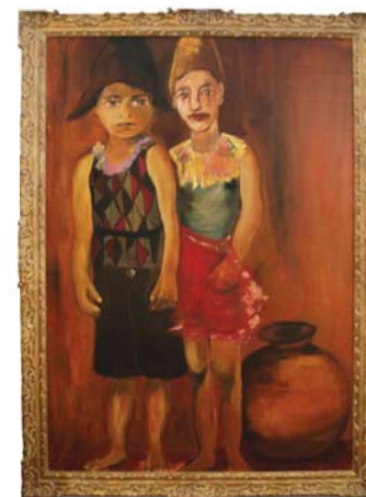
«Boy and Pierrot» Monaco 2003 - Oil on canvas (120x80cm)