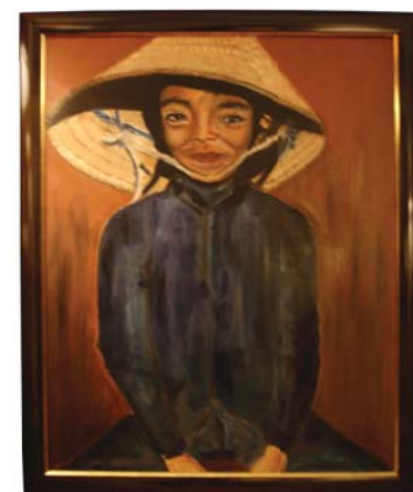
«Vietnamese boy» Monaco 2005 - Oil on canvas (100x80cm)