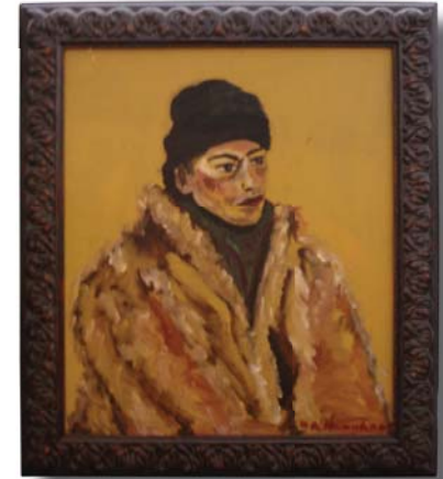
«Brazilian model in fur coat» Atelier of Peter Klashorst Amsterdam 1996 Oil on canvas (70x60cm)