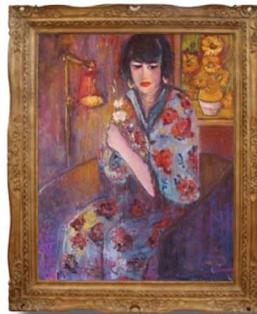
«Japanese girl in kimono» Amsterdam 2010 - Oil on canvas (100x80cm)