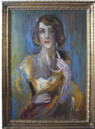
«Portrait of a Dutch Lady» Amsterdam 2006 - Oil on canvas (100x70cm)