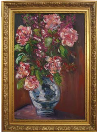
«Flowers in Delftware vase» Monaco 2006 - Oil on canvas (60x40cm)