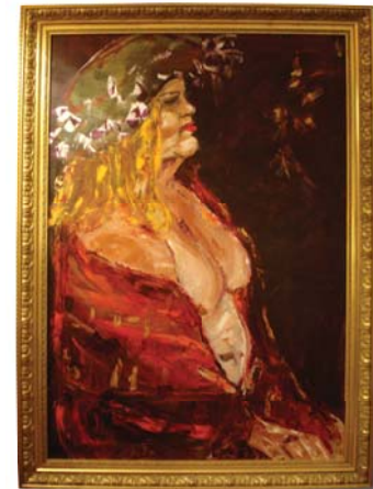
«Dutch model» Laren 2002 - Oil on canvas (100x70cm)