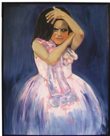
«Angry girl» Monaco 2007 - Oil on canvas (180x120cm)