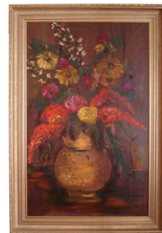
«Sunflowers» Monaco 2004 - Oil on canvas (120x75cm)