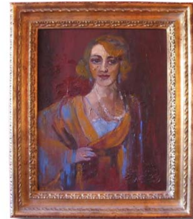
«Small portrait of a Lady» Amsterdam 2006 - Oil on canvas (50x40cm)