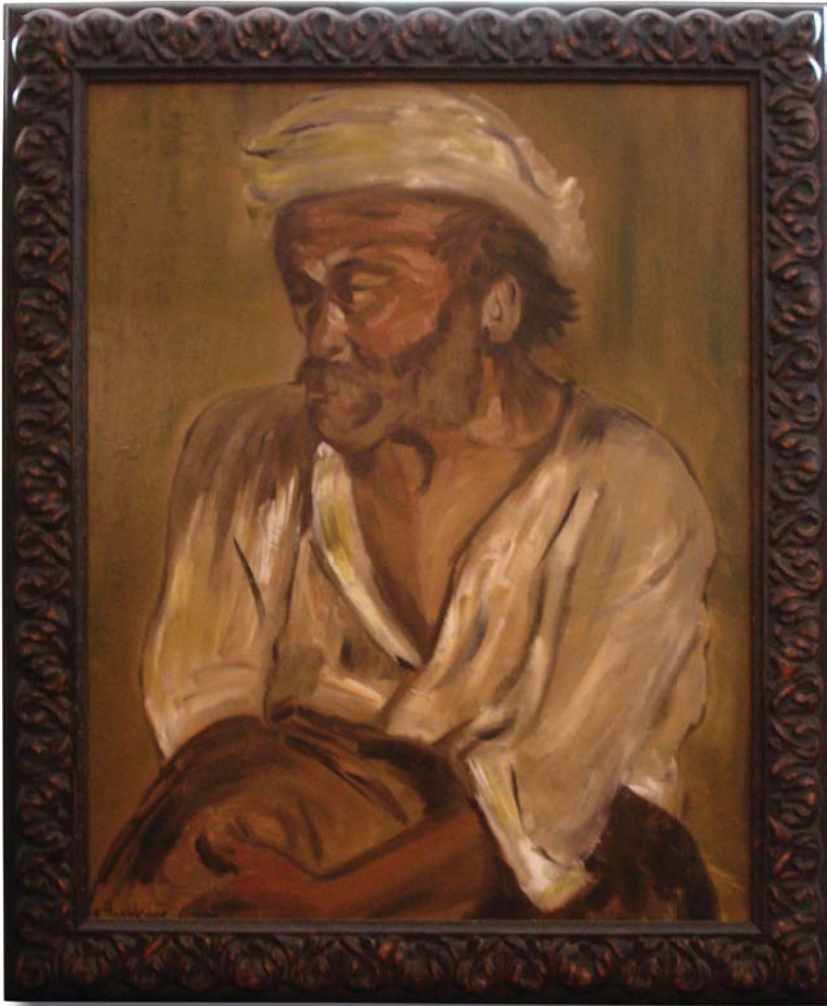
«Vieil homme after Picasso» Monaco 2006 - Oil on canvas (80x65cm)