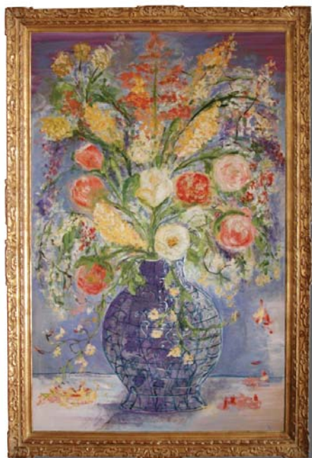
«Flowers in blue vase» Dubai 2010 - Oil on canvas (160x100cm)