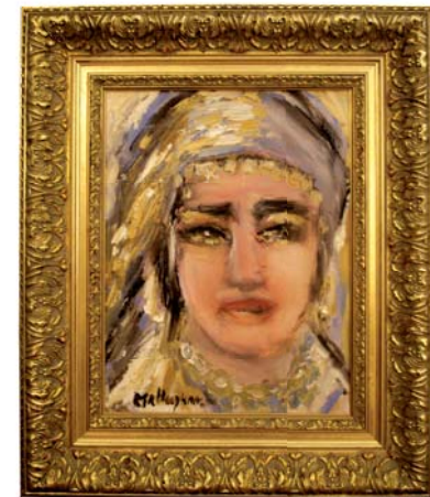
«Self-portrait as Arabian Lady» Monaco 2007 - Oil on canvas (35x27cm)