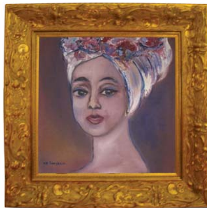
«Portrait of a woman» Monaco 2006 - Oil on canvas (40x40cm)