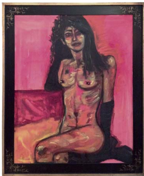
«Ismael» Amsterdam 1999 - Oil on canvas (100x80cm)