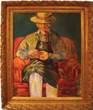
«Erwin or Vincent polishing his shoes» Monaco 2005 - Oil on canvas (92x73cm)