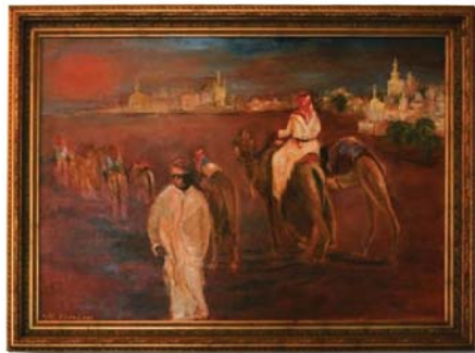
«Camel Caravan» Dubai 2008 - Oil on canvas (100x140cm)