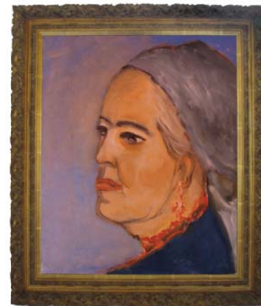
«Dutch woman» Amsterdam 2007 - Oil on canvas (60x50cm)