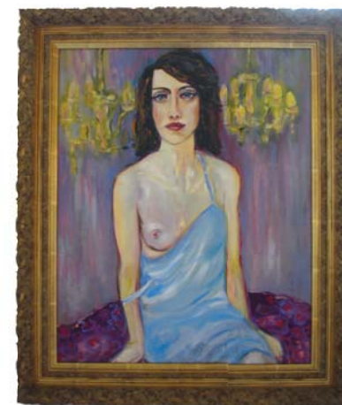
«Semi-nude in room with chandeliers» Monaco 2006 - Oil on canvas (100x81cm)