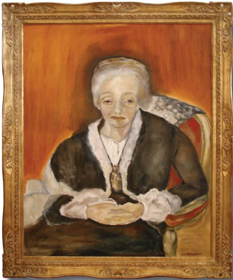
«Grey old lady sitting in chair» Monaco 2007 - Oil on canvas (100x81cm)