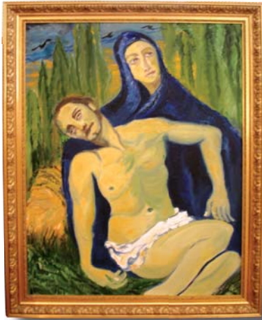
«La Pietà» Monaco 2006 - Oil on canvas (90x70cm)