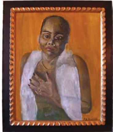
«Woman of Dutch Antilles» Curaçao 2005 - Oil on canvas (75x60cm)