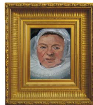
«Elisabeth Bas» Laren 1999 - Oil on canvas (30x25cm)