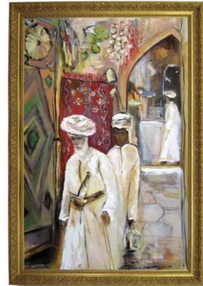
«Souk scene Middle-East» Dubai 2013 - Oil on canvas (80x50cm)