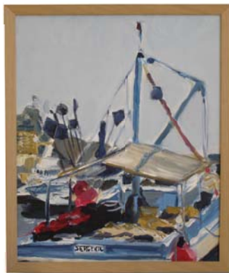
«Boat Le Sergerac» Port de Monaco 2005 - Oil on canvas (45x38cm)