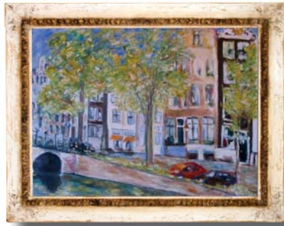
«View on the Keizersgracht» Amsterdam 2007 - Oil on canvas (60x80cm)