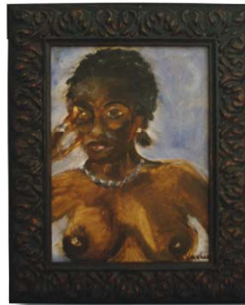
«African model» Amsterdam 1996 - Oil on canvas (40x30cm)