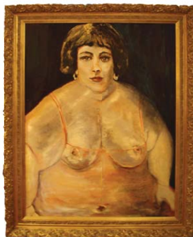
«Nude» Monaco 2006 - Oil on canvas (130x95cm)