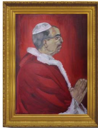
«Pope/Cardinal» Monaco 2006 - Oil on canvas (70x50cm)