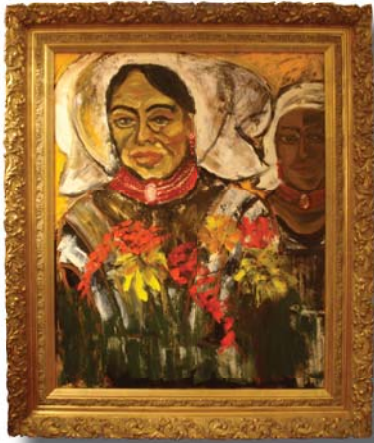
«Femmes Tulips des Pays-Bas» Monaco 2005 - Oil on canvas (92x73cm)