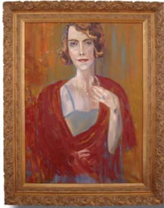
«Lady with red scarf» Monaco 2005 - Oil on canvas (100x70cm)