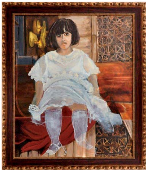
«Reyam - Series Beautiful People #1» Dubai 2012 - Oil on canvas (120x100cm)