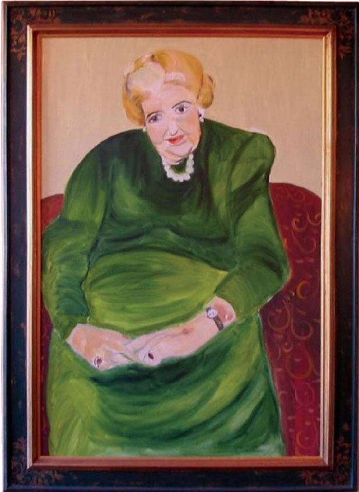
«Old Lady in green» Amsterdam 2006 - Oil on canvas (120x80cm)