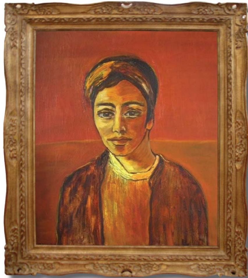
«Rainfall in Dubai» Monaco 2005 - Oil on canvas (70x50cm)