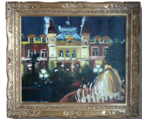
«Casino Monte-Carlo at night» Monaco 2005 - Oil on canvas (54x65cm)