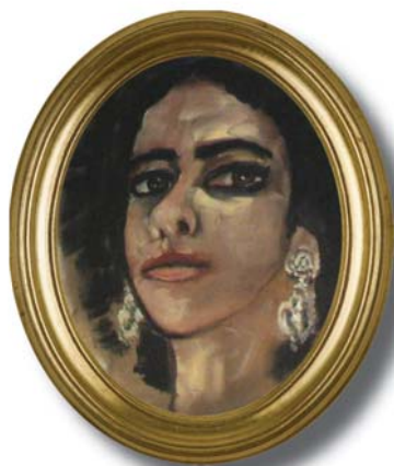
«Self-portrait» Monaco 2005 - Oil on canvas (35x30cm - oval)