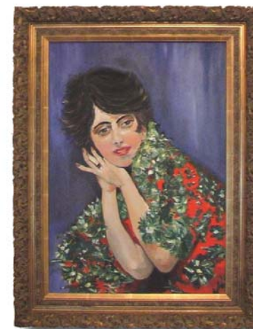
«Woman with flower scarf» Monaco 2006 - Oil on canvas (90x70cm)