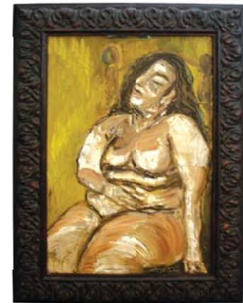
«Suffering lady» Curaçao 2004 - Oil on canvas (60x40cm)