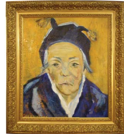
«Old Dutch woman inspired by van Gogh» Monaco 2004 - Oil on canvas (55x46cm)