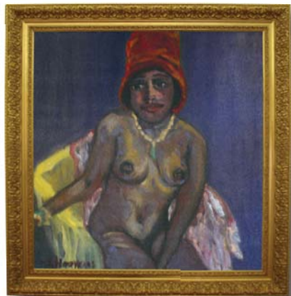
«Girl after Sluijters» Monaco 2004 - Oil on canvas (50x50cm)