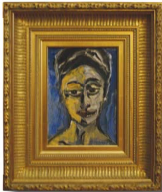
«Self-portrait» Monaco 2005 - Oil on canvas (18x13cm)