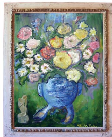
«Flowers et le penseur» Dubai 2013 - Oil on canvas (90x70cm)