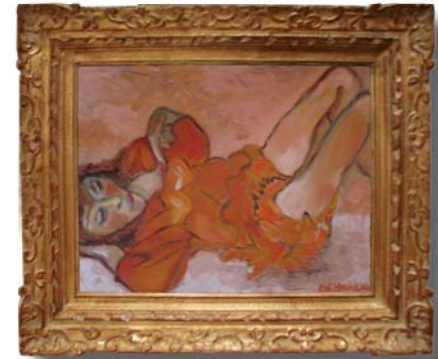
«Girl after Schiele» Monaco 2006 - Oil on canvas (28x38cm)