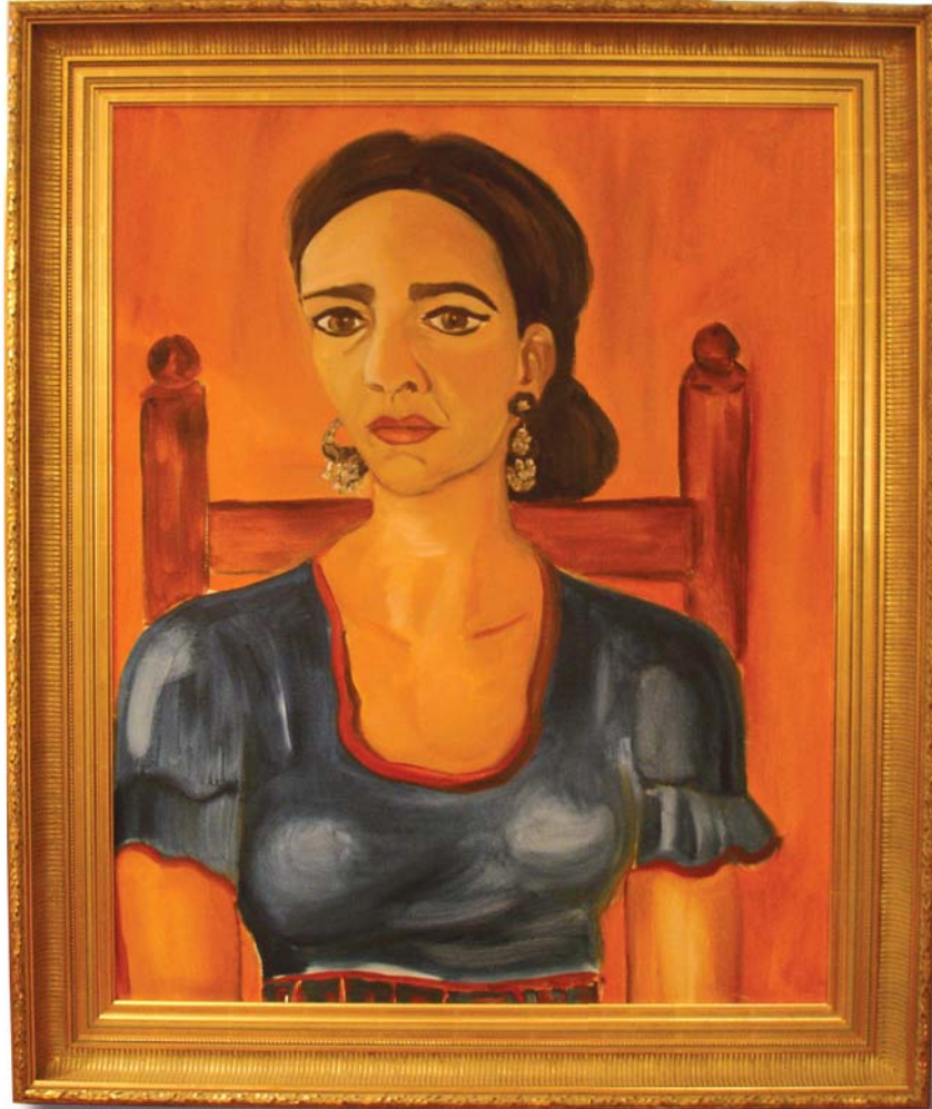
«Self-portrait sitting in chair» Monaco 2005 - Oil on canvas (92x73cm)