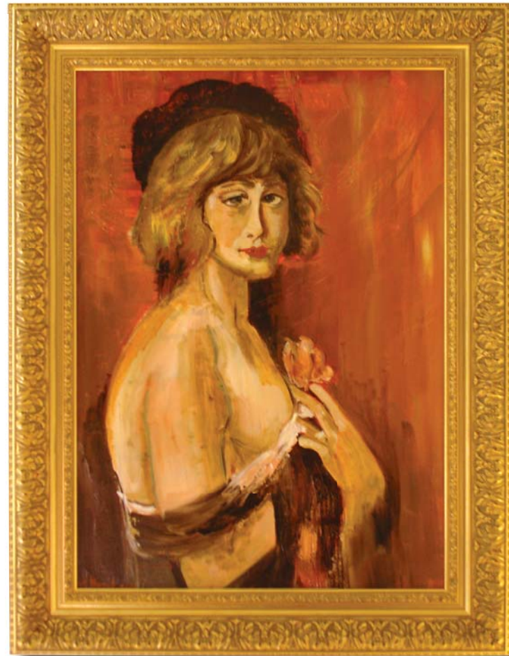
«Cross eyed girl» Monaco 2005 - Oil on canvas (70x50cm)