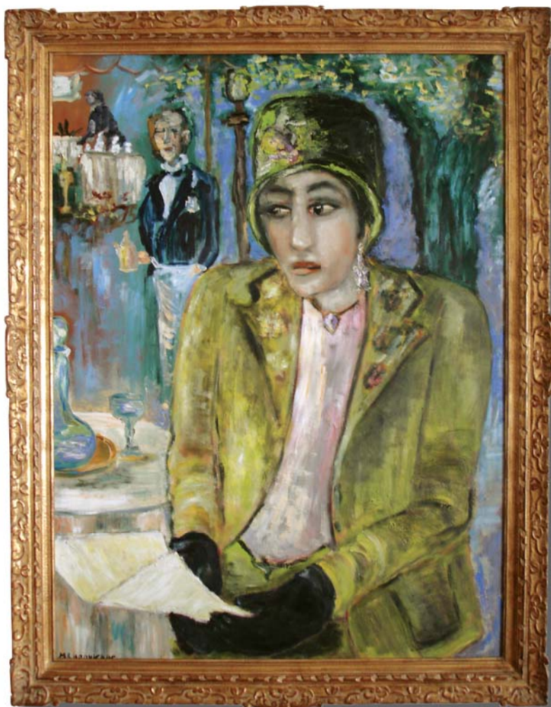
«The Will» Monaco 2006 - Oil on canvas (130x100cm)