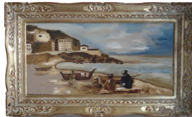
«Old Nice» Monaco 2006 - Oil on canvas (40x80cm)