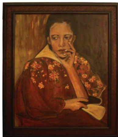
«Bregje in kimono» Monaco 2005 - Oil on canvas (82x65cm)