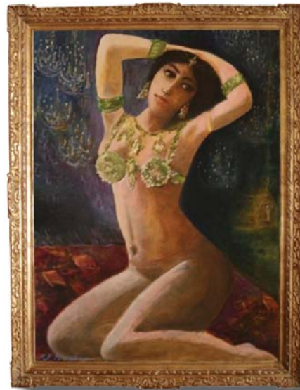
«Mata Hari» Dubai 2008 - Oil on canvas (130x97cm)