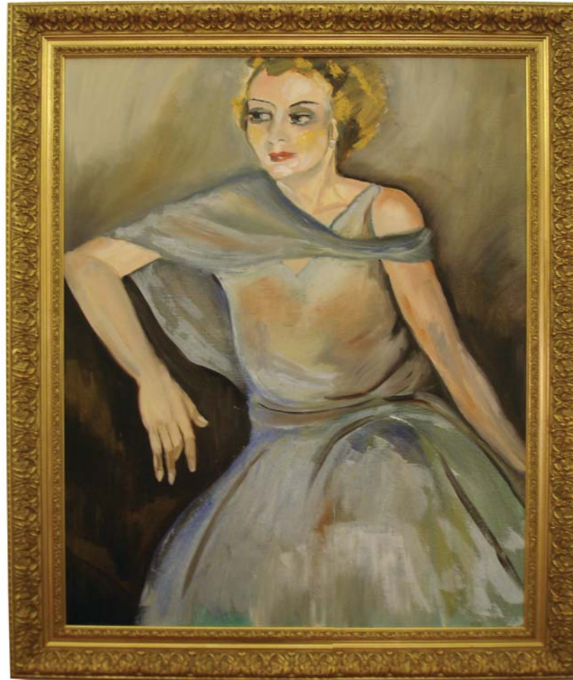
«Lady in blue» Monaco 2003 - Oil on canvas (95x75cm)