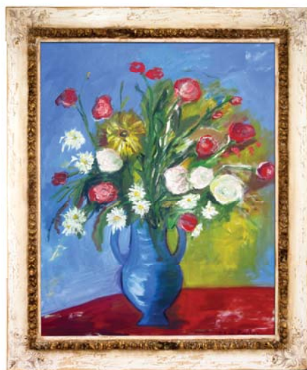
«Flowers in blue vase» Dubai 2013 - Oil on canvas (120x100cm)