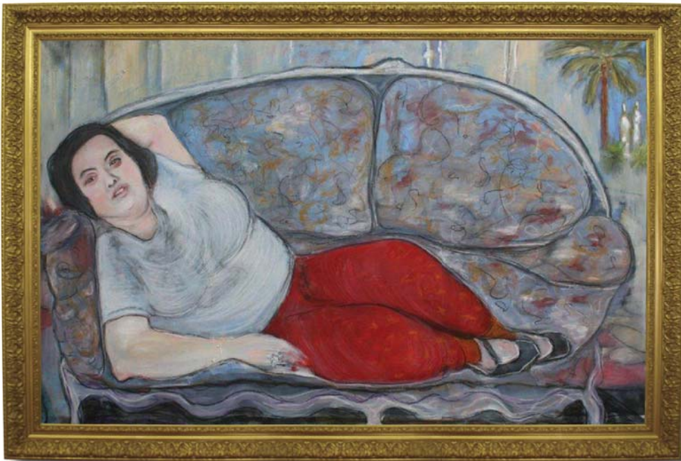
«Sabahat - Series Beautiful People #2» Dubai 2012 - Oil on canvas (100x160cm)