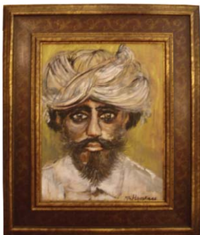
«Arab» Monaco 2007 - Oil on canvas (46x35cm)