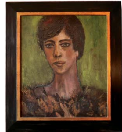
«Italian Lady with short hair and boa» Amsterdam 2007 - Oil on canvas (60x50cm)