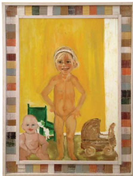
«Childhood» Monaco 2004 - Oil on canvas (70x50cm)