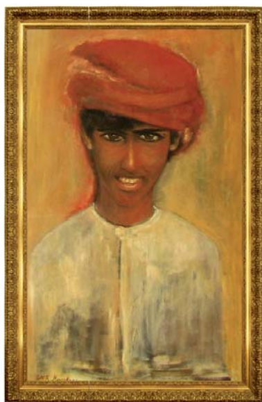
«Boy from Oman» Dubai 2008 - Oil on canvas (120x80cm)