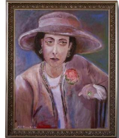
«The Will 2, Lady with hat» Dubai 2008 - Oil on canvas (95x75cm)