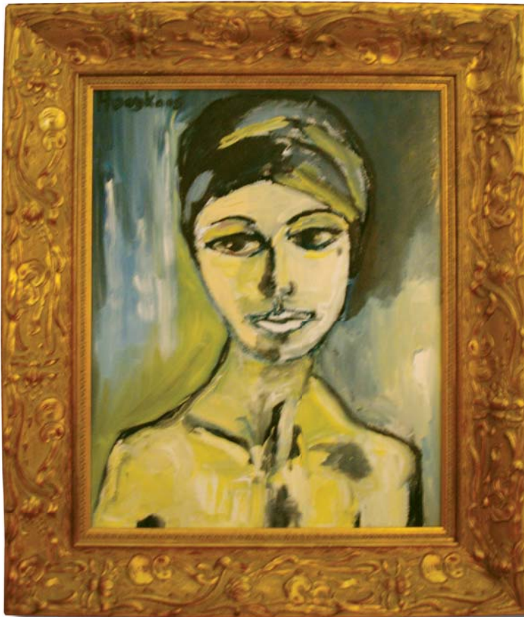
«Self-portrait after van Dongen» Laren 2002 - Oil on canvas (50x40cm)