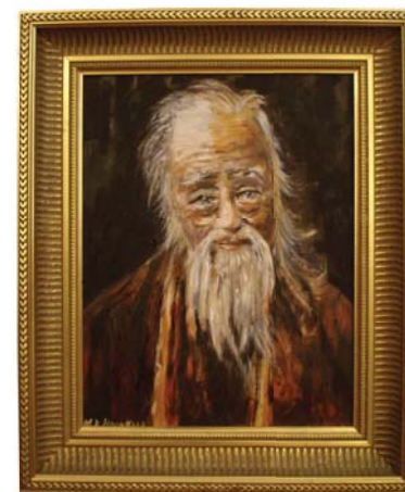
«Old Chinese man» Monaco 2007 - Oil on canvas (35x27cm)