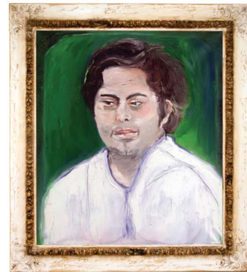
«Hussain - Series Beautiful People #4» Dubai 2013 - Oil on canvas (70x60cm)