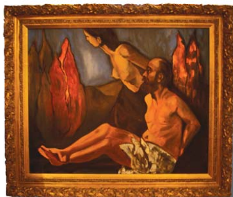
«Simon after Czernus» Monaco 2005 - Oil on canvas (81x100cm)