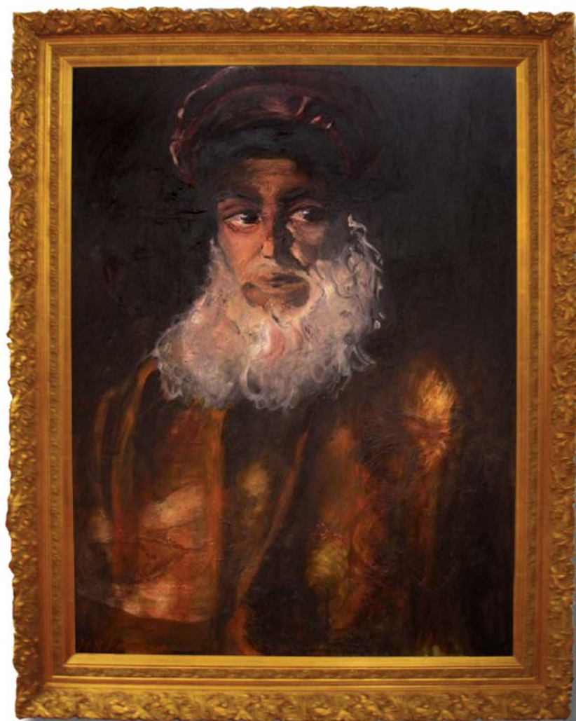
«Pakistani» Dubai 2008 - Oil on canvas (130x100cm)