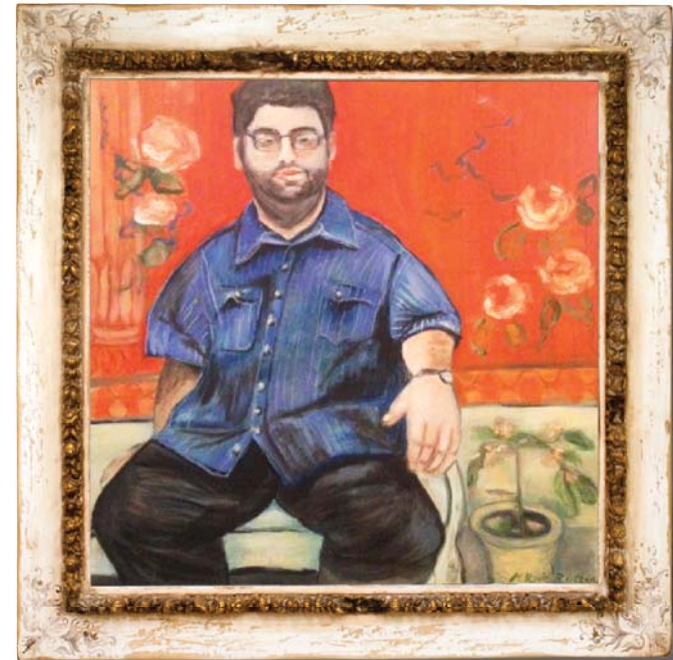
«Zaid - Series Beautiful People #5» Dubai 2014 - Oil on canvas (100x100cm)