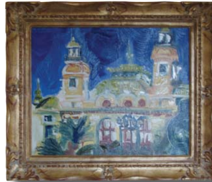
«Casino Monte-Carlo by daylight» Monaco 2005 - Oil on canvas (45x60cm)