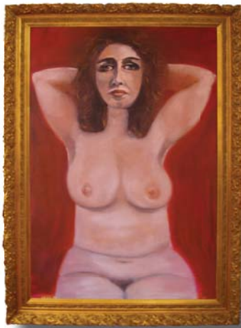
«Nude with red hair» Amsterdam 2007 - Oil on canvas (120x80cm)