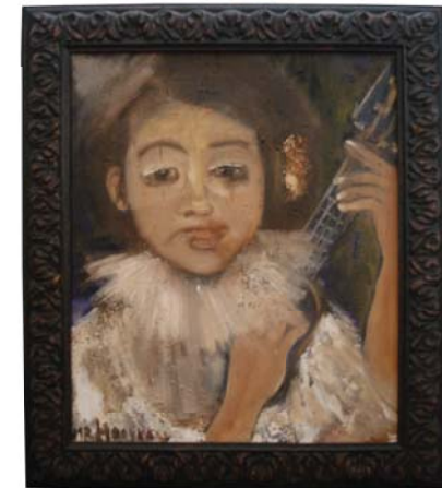
«Chinese girl playing the guitar» Monaco 2005 - Oil on canvas (65x55cm)