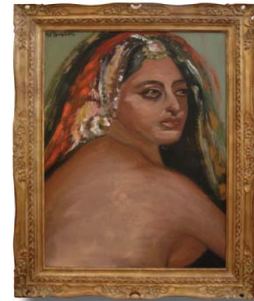
«Arabian Queen» Monaco 2005 - Oil on canvas (80x65cm)