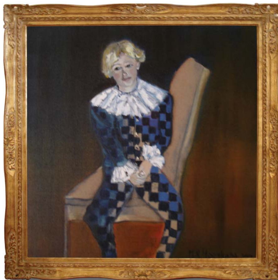
«Baruch as a Pierrot» Monaco 2003 - Oil on canvas (60x60cm)