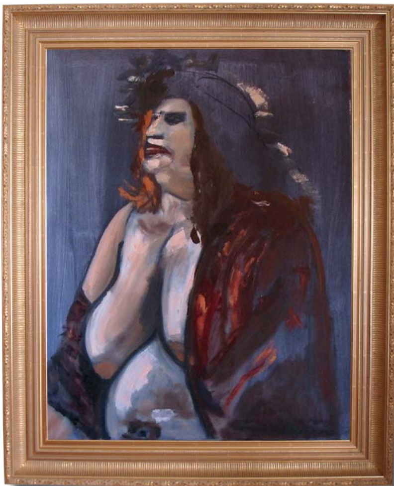
«Dutch model» Laren 1999 - Oil on canvas (90x70cm)