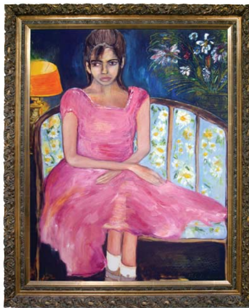
«Zara - Series Beautiful People #3» Dubai 2013 - Oil on canvas (150x120cm)