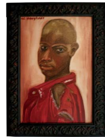
«Boy from Niger» Monaco 2005 - Oil on canvas (60x40cm)